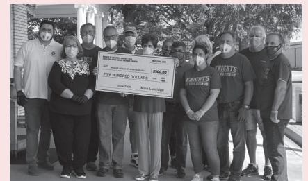
The Jesus Christ Our Risen Savior Knights of Columbus

Due to the stay at home order issued early on and the risk factors involved for seniors, many of our faithful volunteers could not deliver. The Lord provided in an incredible way as several churches asked how they could help. NewSpring Church, Anderson Mill Baptist Church and The Jesus Christ Our Risen Savior Knights of Columbus, amongst many individuals came to help with meal deliveries. We owe each of those represented a debt of gratitude! We could not fulfill our meal delivery efforts without assistance of our community.